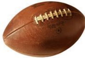
Lewis Chapel "Cardinals"